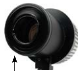
Once the front half of the unit is removed, you will see where the gobo is

The reflective / mirror side must face the LED light source