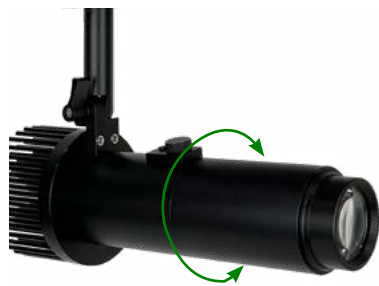
Undo the unit from the centre of the projector to access the gobo.

Make sure the circlip is pushed down so that the gobo is sitting flat, if not you will struggle to focus evenly on the gobo.